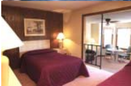
Mountain Laurel Inn